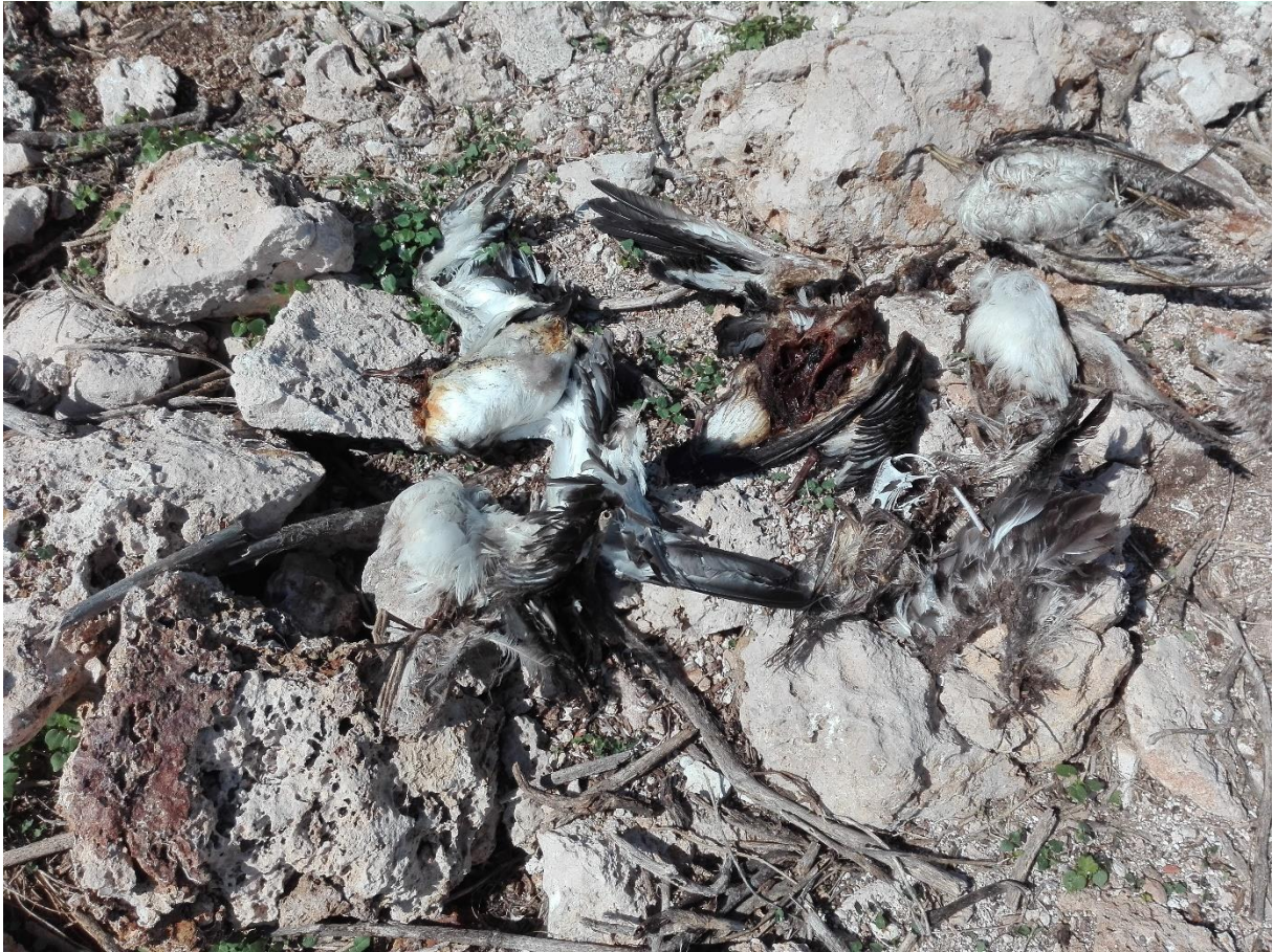
Figure 2. Some of the Shearwater chicks killed by Yellow-legged Gulls before fledging (early October 2018).