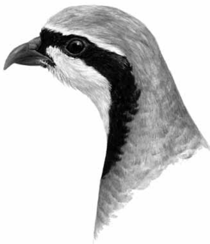
Coturnice ( Alectoris graeca )