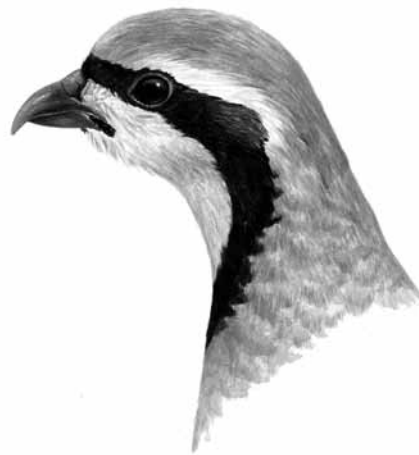
Chukar ( Alectoris chukar )